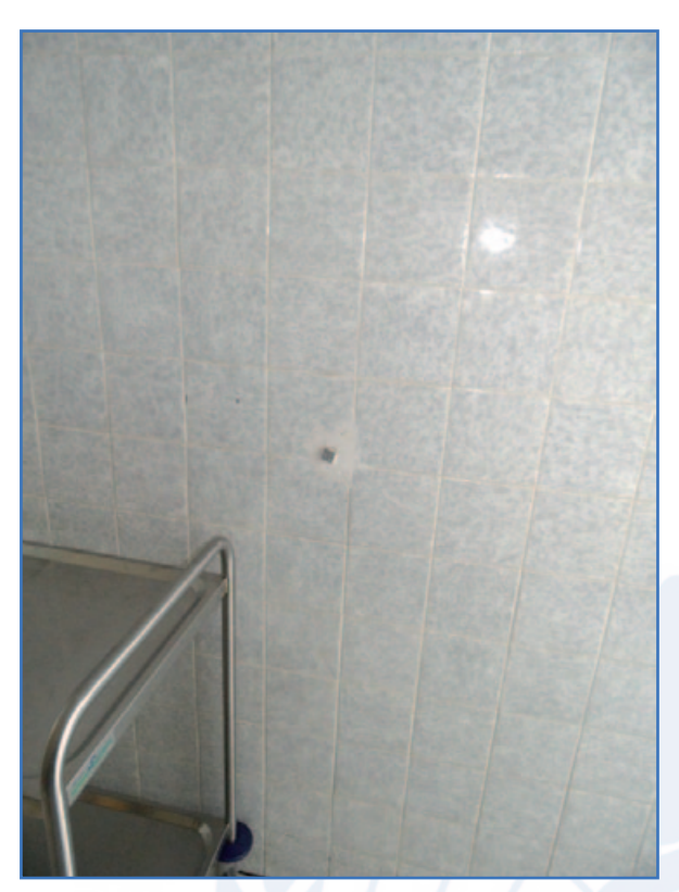
Figure 4: Dead pipe end

The PWH flow pipe and the PWH-C return pipe (circulation waters) showed L. pneumophila concentrations in all samples of every single building below the technical value at which action is to be taken. Concentrations of over 100 CFU/100 ml were recorded within the building at numerous riser pipes.