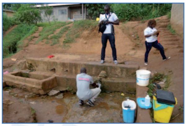
Figure 3: Sampling and documentation of sampling point characteristics at a spring used by more than 500 people as a source for drinking water.

The visited water sources ranged in the risk assessment from low, intermediate, high to very high and showed different microbiological contaminations. The wa-