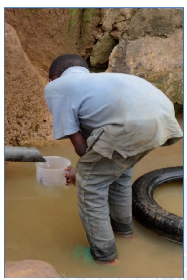
Figure 2: Natural spring used by approximately 50 persons as drinking water source

of natural water sources, one main topic was an ongoing training in good laboratory practice and quality assurance. The master and PhD students of the WWRU designed sampling-sheets that contained relevant information to be gathered in the field during the sampling, and tables to document the measured on-site parameters. Additionally, sheets to document the microbiological results produced in the laboratory were set up.