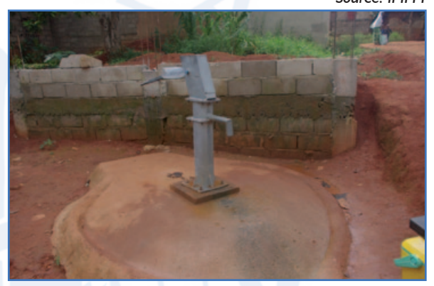
Figure 4: Well maintained dug well with a hand pump used by 400 people as drinking water supply

ter source with a very high risk did not automatically result in a high contamination, and therefore further analysis of the recorded catchment conditions are currently being undertaken.