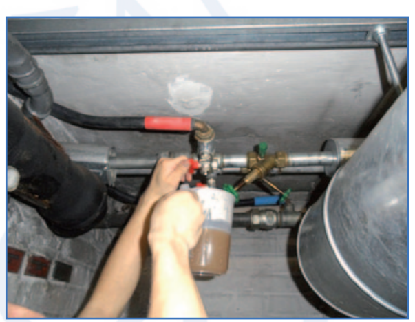
Figure 1: Discoloration of water taken from the drinking water pipeline

The aim of the subproject is to gather systematically relevant details (materials, geometry, utilization etc.) together with a spatially and temporally continuous sampling of different drinking-water installations with known mi-