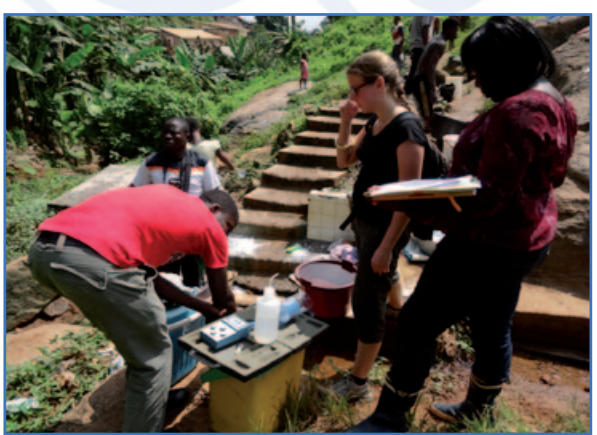
Figure 1: Measuring the on-site parameters at a water source

The German Federal Ministry of Education and Research has funded a Mobility Measure which enabled members of the Waste Water Research Unit (WWRU) of the University of Yaoundé to visit the Institute for Hygiene and Public Health (IHPH) at the University of Bonn. During their stay, the Cameroonian researchers were trained in the analysis of coliphage in water and had the opportunity to learn about German wastewater and drinking-water treatment. In exchange, two scientists of the IHPH traveled to Yaounde, Cameroon, during December 2013. The German guest scientists worked closely together with the students of the WWRU to increase scientific knowledge in the field of water quality, sanitation and