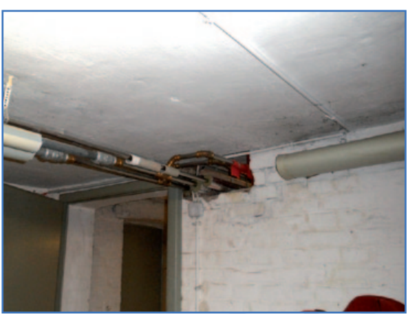
Figure 2: Insufficient insulation of the piping

crobial contamination, and to develop and evaluate empirically-based, rational screening strategies for the fast, secure and cost-effective detection, characterization and monitoring of systemic microbial contamination, in order to formulate evidence-based advice for the screening of drinking-water installations in the field.