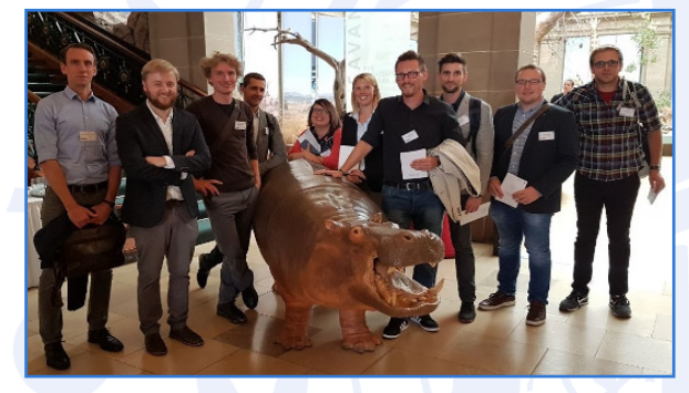
Figure I: First cohort of PhD Students under the program FUTURE WATER (2015)

FUTURE WATER (http://www.nrw-futurewater.de/ index.php/home.html) is one of these PhD programs and it kicked off in November 2015. The first cohort consisted of 12 implemented projects and 2 associated projects focusing on sustainable solutions for the challenges of the water sector. The program brought together PhD students with different backgrounds, such as environmental engineering, water chemistry, microbiology and - more exotic but in line with its interdisciplinary focus - philosophy and business economics, to position themselves and their work at the juncture of academia, society and policymaking. Thanks to the trans- and interdisciplinary nature of the program, requiring the students to work closely with each other as well as with mentors, the PhD projects strongly focussed on current and future water challenges in the urban context.