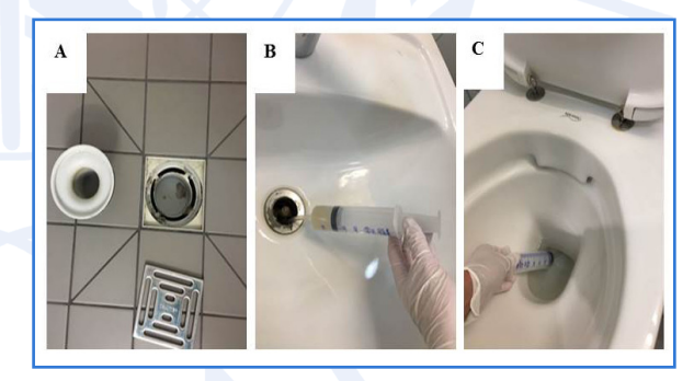
Figure 2: Sampling spots (exemplary): A) shower drainage B) sink and C) toilet (Voigt, A. et al., 2019)

The presented study is part of a PhD-Thesis which is also focused on the complexity and the importance of clinical wastewater as well as the development of a fast and simple screening method for a high number of antibiotics in different aquatic matrices. The study shows that wastewater systems of hospitals represent a potential reservoir for antibiotic residues in areas of direct exposure for vulnerable patients, especially for clinics with high antibiotic consumption. To the best of our knowledge, the occurrence of high antibiotic residue concentrations in clinical sanitary facilities is neglected in the current regulatory guidelines (e.g. cleaning plan). Therefore, there is a need for further research on the possible influence of such high concentrations on the respective microbiome as well as operational research for the development of possible solutions for the reduction of antibiotic residues in clinical sanitary units to inform future guidelines and challenge. respond to this major