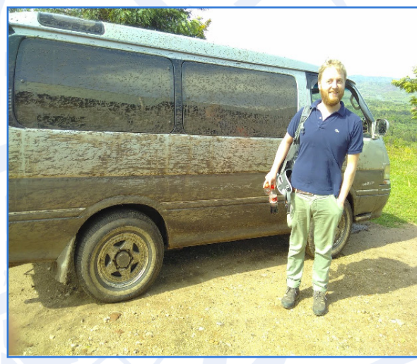
Figure 2: Ready for field work, collecting river sediments in Germany

Through the synergy between FUTURE WATER and SAFE RUHR and with the collaboration of Dr Martin Mackowiak at the Biofilm Centre at the University Duisburg-Essen, it was decided to investigate river sediments and (epilithic) biofilms on the surface of river rocks – both neglected environmental reservoirs for faecal indicator bacteria (FIB), faecal derived coliphages as well as human pathogenic viruses – in comparison to the aquatic environment (Mackowiak et al., 2018). While the nature of both sample matrices did not allow for a quantification of human viruses, qualitative analysis using the EMA/PMA based molecular methods showed a relatively high abundance of HAdV across the samples, specifically in 54% of the biofilm samples and 50% of the sediment samples.