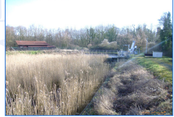
Figure 1: Retention soil filter

The pollutants burden arising from sources such as sewage, combined sewer, and stormwater discharges have been already documented in various publications and research projects (Rechenburg and Kistemann, 2009; Rechenburg et al., 2006; SWIST I 2001; SWIST II 2004; SWIST III 2007; SWIST IV 2012). Additional burdens affecting contaminations with micropollutants have been identified from diffuse pollution or the runoff over drained areas (Mertens et al., 2017; Schreiber et al., 2016).